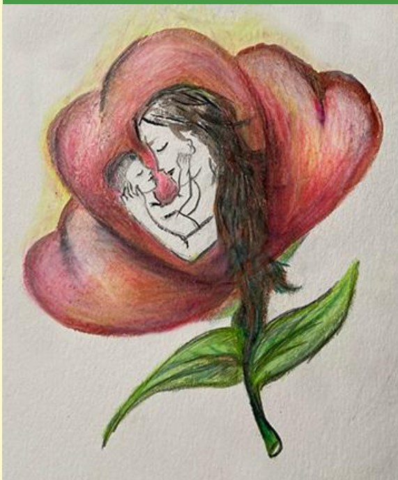
Illustration by Candan Serbest